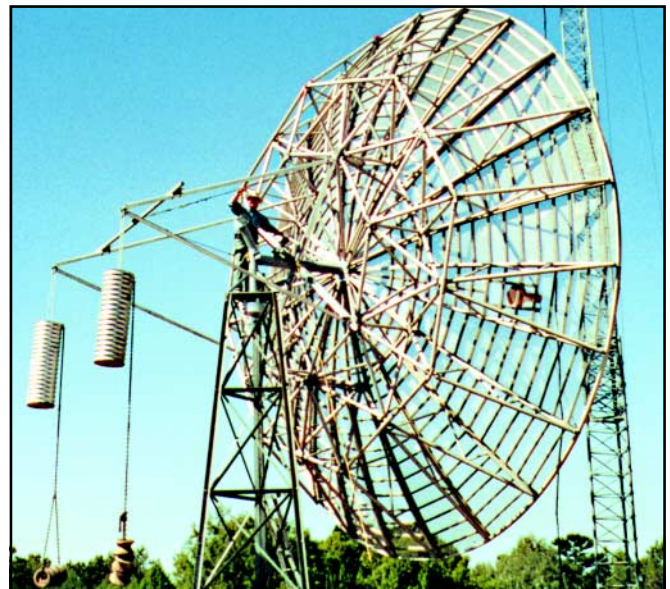
That's Bob, K0YW, perched on top of the tower tripod making adjustments to his 30-foot dish before the contest.